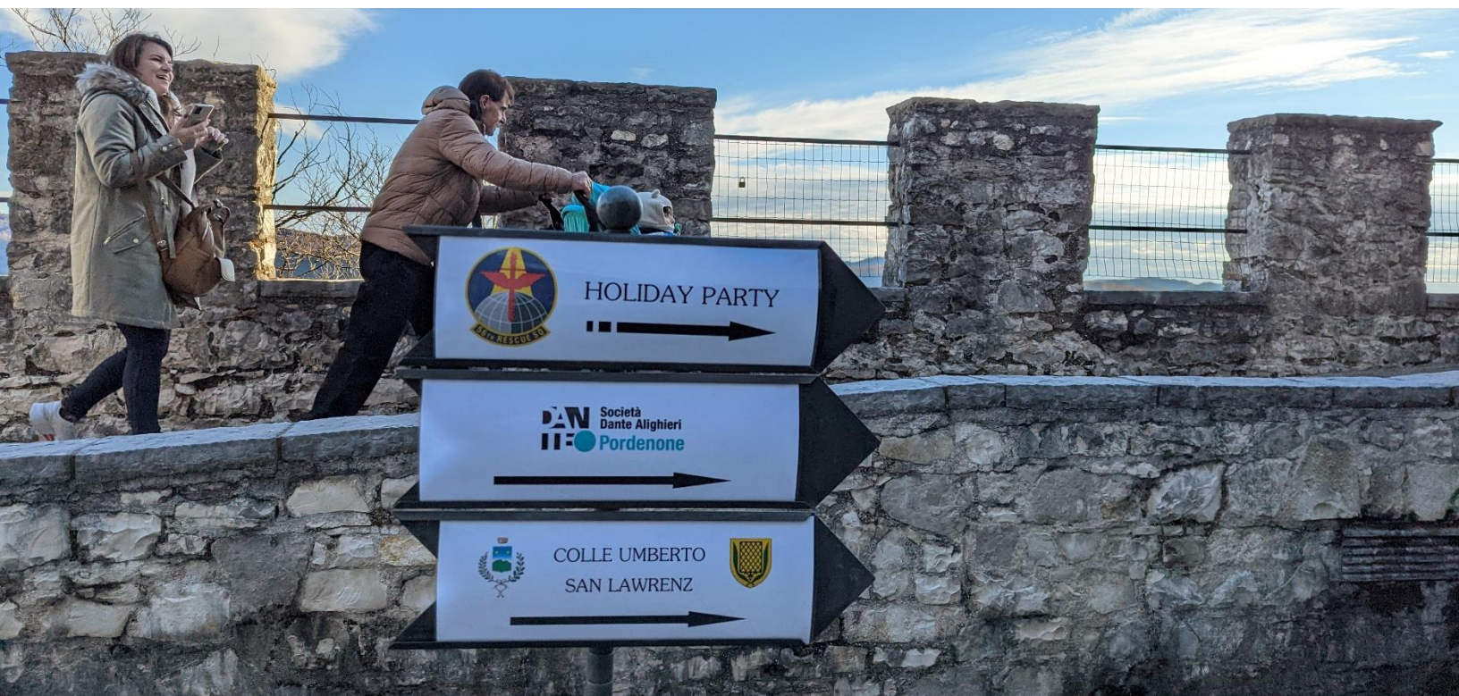
Kunsill Lokali San Lawrenz Comune di Colle Umberto January, 2023